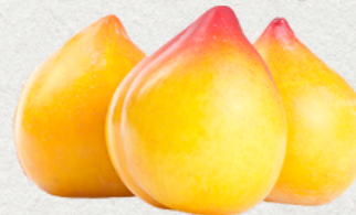
YELLOW LEMON PLUMS (IMPORT) 40/48 CT. 16 LBS. • 014-01333 *AVAILABLE 1/27