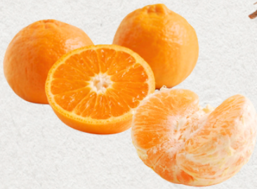
PIXIE MANDARINS 20 LBS. • 012-02004