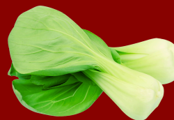
BABY BOK CHOY (SHANGHAI) 30 LBS. • 016-03305