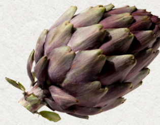
PURPLE ARTICHOKE 12 CT. • 016-01014 *AVAILABLE 1/27