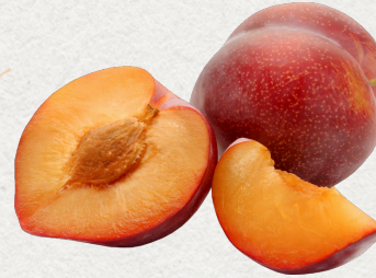
RED PLUMS (IMPORT) 30/36 CT. 16 LBS. • 014-01387 *AVAILABLE 1/25