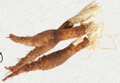
SALSIFY 10 LBS. • 017-01003