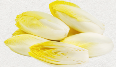
BELGIAN ENDIVE 10 LBS. • 017-01029