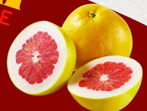
VALENTINE PUMMELOS 23 CT. • 012-01013