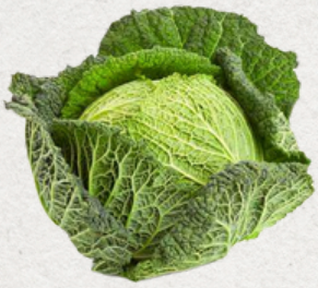
SAVOY CABBAGE, ORGANIC 30 LBS. • 040-05532