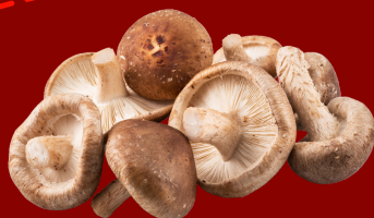
SHIITAKE MUSHROOMS 5 LBS. • 017-01122