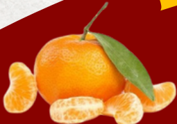
STEM & LEAF PAGE MANDARINS 22 LBS. • 012-02061